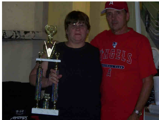
Club Participation Award for most PT's at the Double D meet & greet in Riverside 8/15/07.