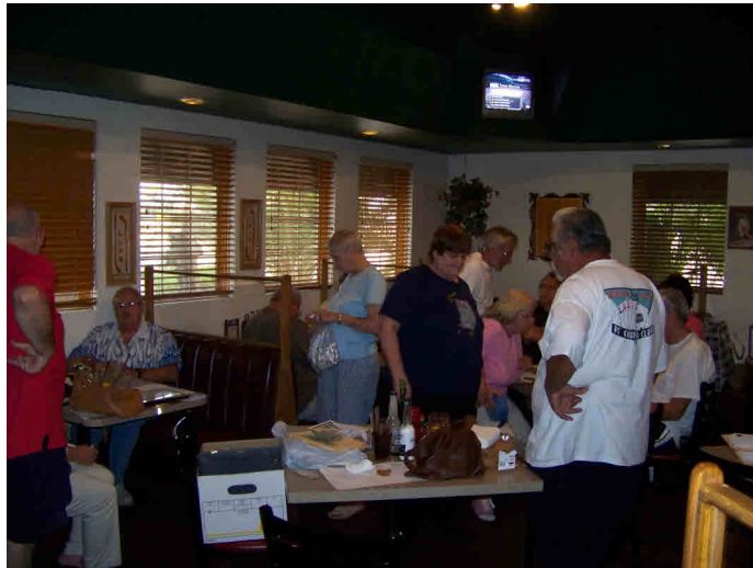
August meet & greet at Screw Balls.